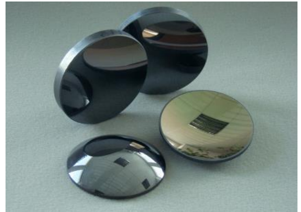
Typical delivery in form of blanks:

VITRON currently produces 5 different types of Chalcogenide Glass that are applicable to optics and optoelectronics system design.